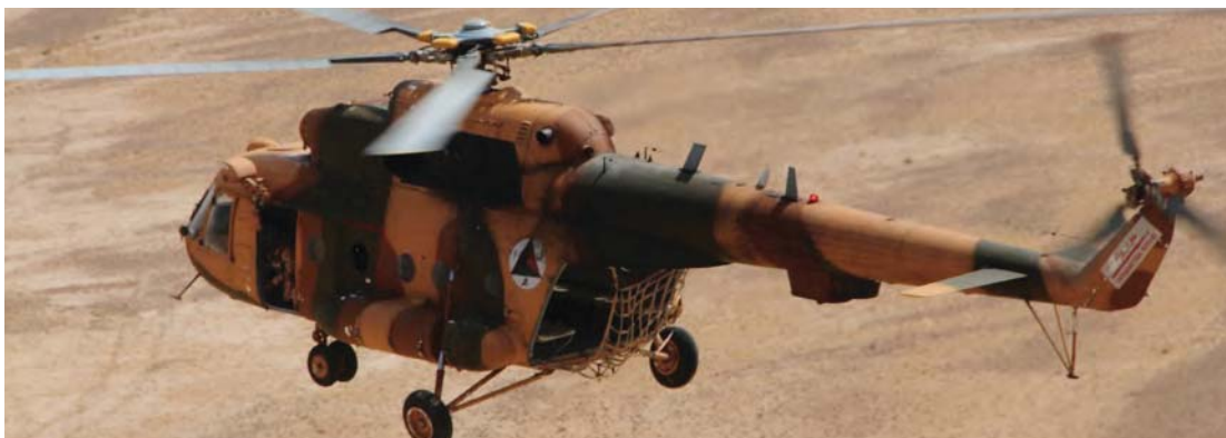
Figure. Mi-17 Flying Over Afghanistan

The Mi-17 supports the United States’ and partner nations’ counterterrorism efforts. The Mi-17 is a medium-lift utility helicopter that can perform both attack and movement missions and is one of the most common helicopters in the world. The Mi-17 is manufactured in Russia at the Kazan helicopter and the Ulan-Ude aviation plants. The governments of Iraq, Pakistan, and Afghanistan requested that the United States provide Mi-17 support for their counterterrorism efforts. The U.S. Government procured Mi-17s to provide those partner nations assistance and address their immediate operational requirements. The Afghans have been using Mi-17 helicopters since the early 1980s because of the aircraft’s ability to operate in the country’s severe environment and fly at high altitudes and in high temperatures with heavy loads.